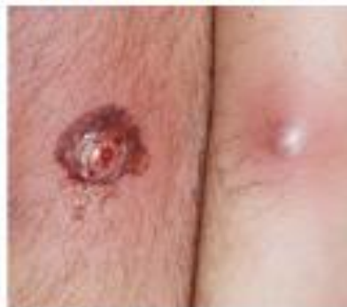
Staph Infection ("Boil") Possible MRSA