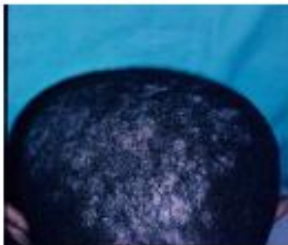
Tinea Capitis ("Ringworm")