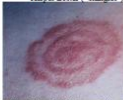
Tinea Corporis ("ringworm")