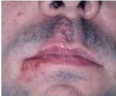
Herpes Simplex ("cold sore")

These pictures are presented to provide general information about skin lesions that may be incompatible with competition. They are not meant to guide diagnostic decisions and are not an exhaustive demonstration of all infectious lesions or of all possible variations in appearance. Diagnosis of skin lesions should only be performed by appropriately licensed medical professionals.