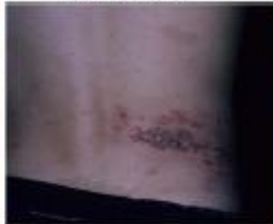
Herpes Zoster ("Shingles")