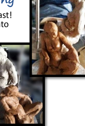
Document your work with iPad or phone. All clay is recycled onsite. Sculptors alternate as models (clothed) 5-10 min each. Wear a smock or live muddy!

Speed Figure Sculpting is a 3-D blast! Quickly transform hunks of clay into powerful memorable forms.