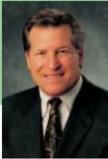
Keynote Speaker on Friday, March 12, 2004.