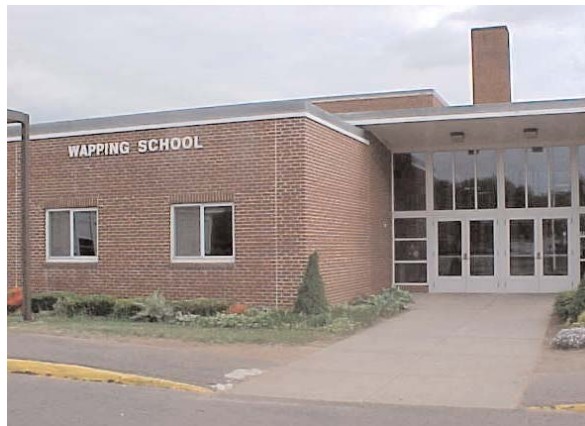
Wapping Elementary School, South Windsor 2005 Elementary School of the Year