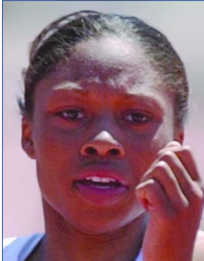
Allyson Felix Los Angeles (California) Baptist

...MOST TOUCHDOWNS IN AN EIGHT-PLAYER FOOTBALL GAME?