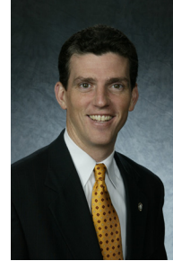
Attorney General Patrick Lynch

As co-chairs of the Task Force on School and Campus Safety formed by the National Association of Attorneys General (NAAG), we are pleased to present a report and recommendations for your consideration. With assistance from nationally recognized experts in the field of school and campus security, the Task Force examined a number of issues that have again been thrust upon the public consciousness as a result of the recent tragedy on the campus of Virginia Tech and incidents of violence at schools across the country.