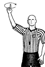
Shot Clock Reset