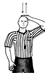
Shot Clock Violation